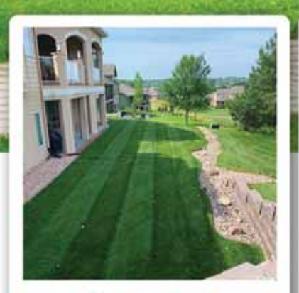
Sustainable Lawn Care Program

Our #1 goal is to maintain your lawn at the very highest quality!