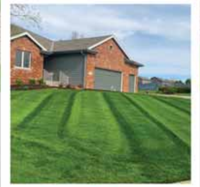
Mowing & Trimming