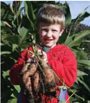
Sweet Potato Dig at Dundee Community Garden